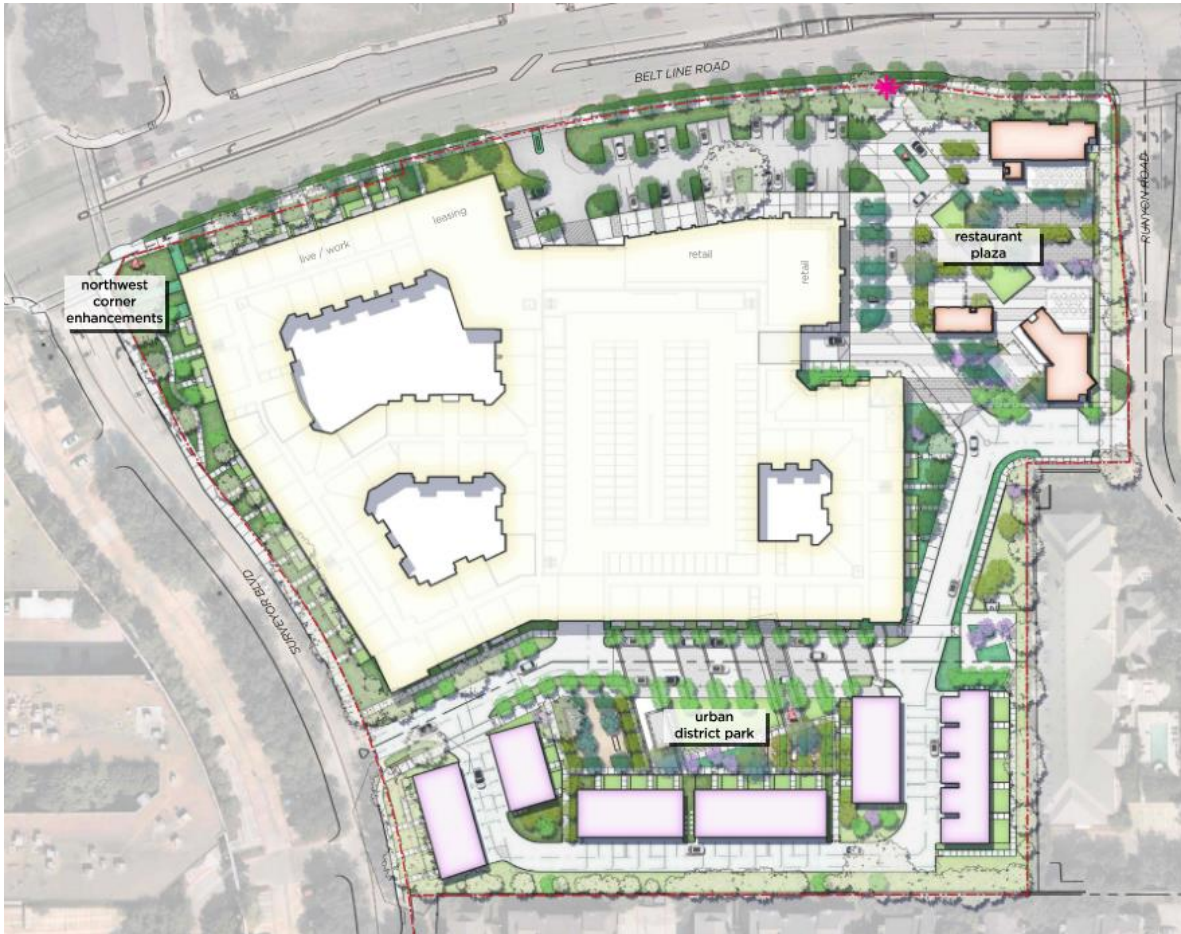
Proposed Concept Plan