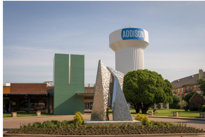
Tango Fantasia by Art Fairchild