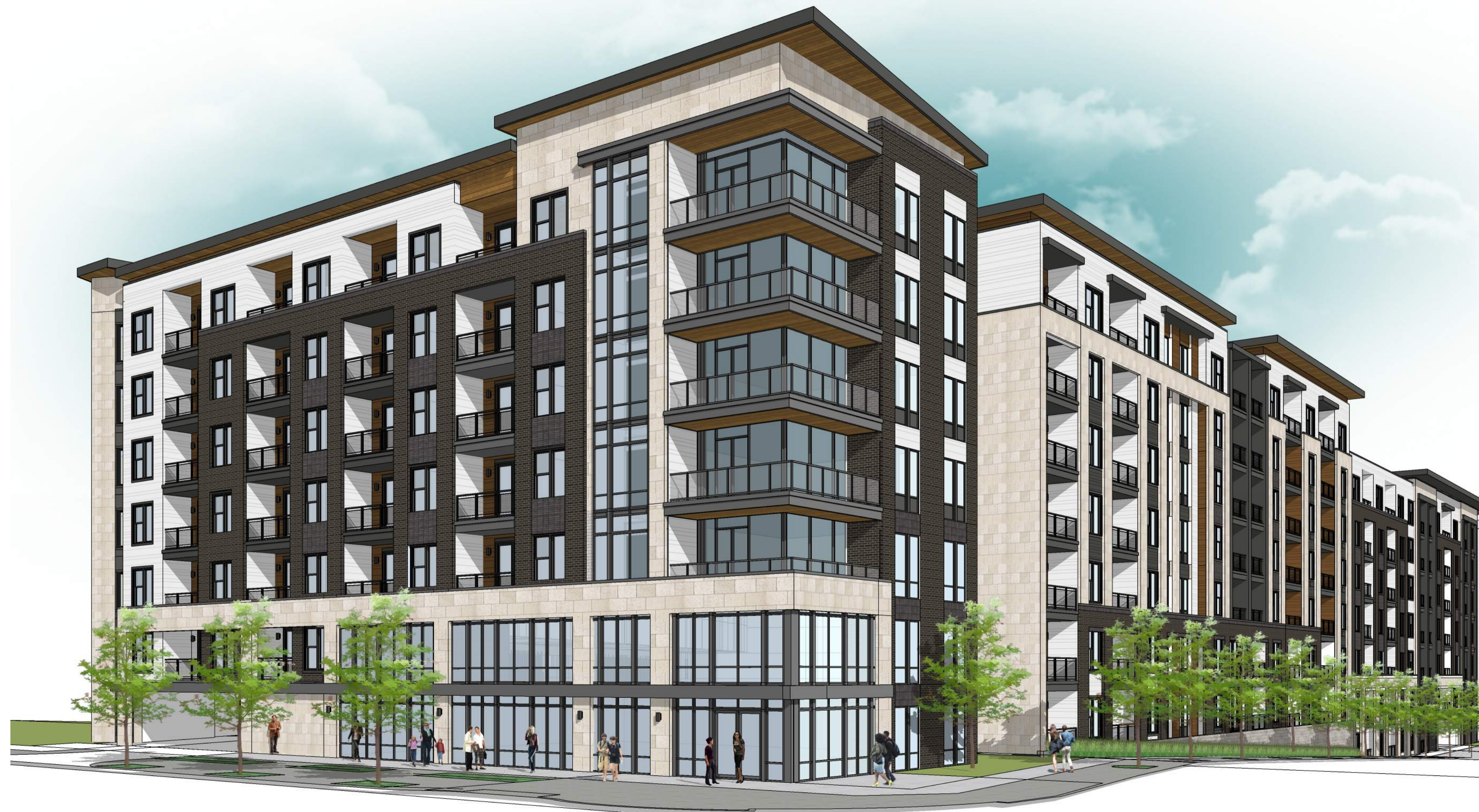
1 PODIUM - PERSPECTIVE