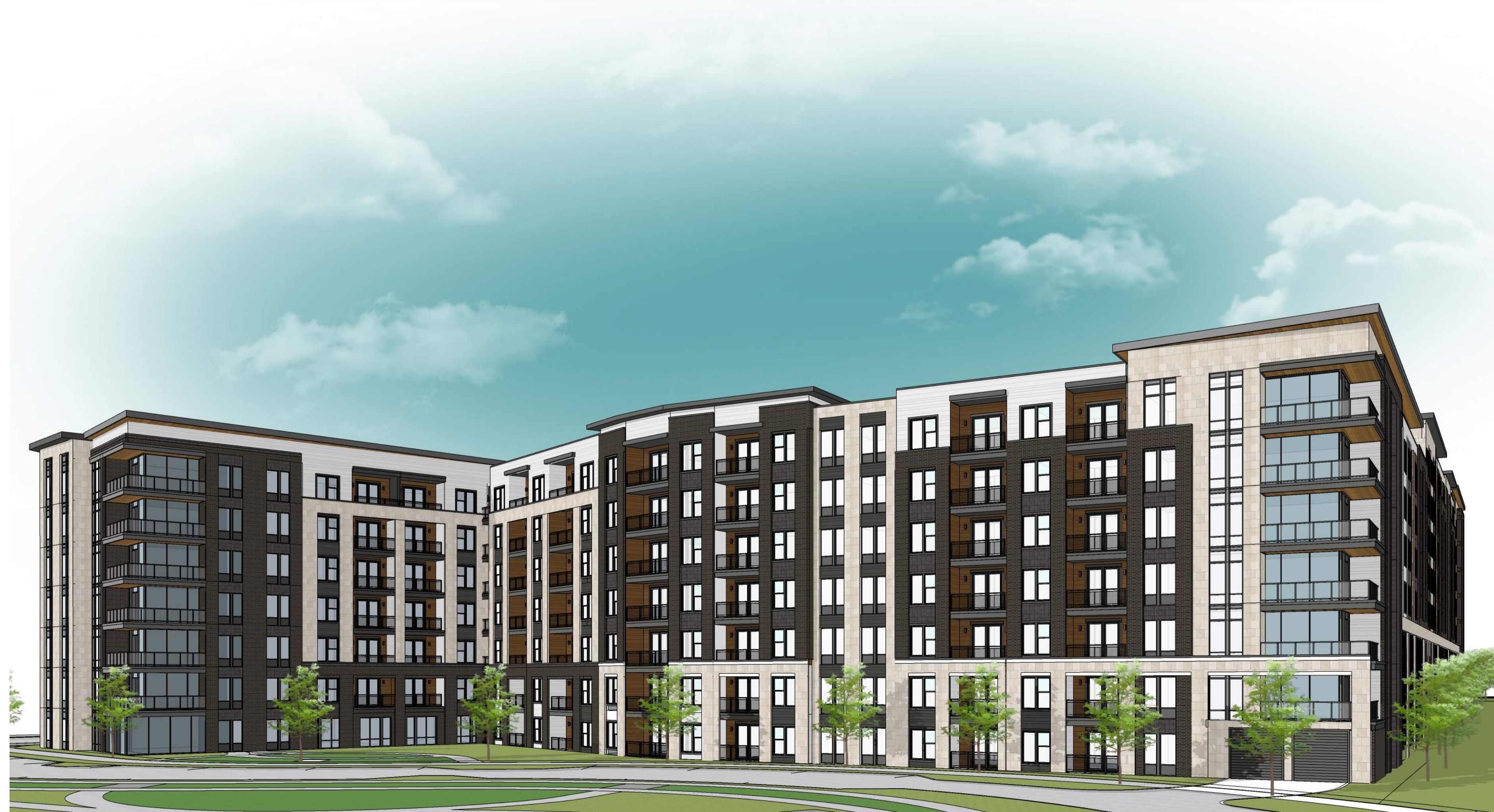
2 PODIUM - PERSPECTIVE