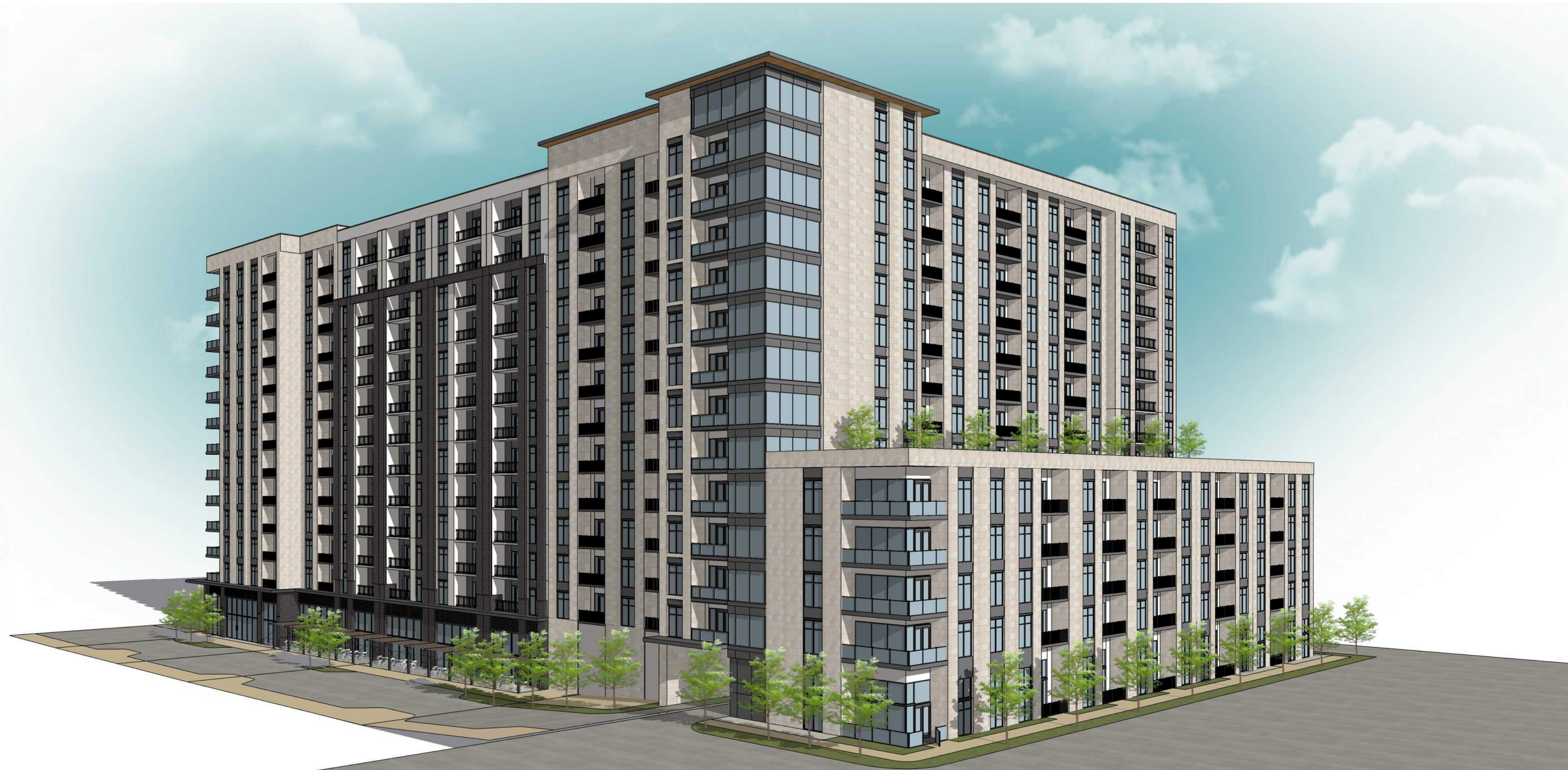
01 MULTIFAMILY HR OPT. 1 - PERSPECTIVE