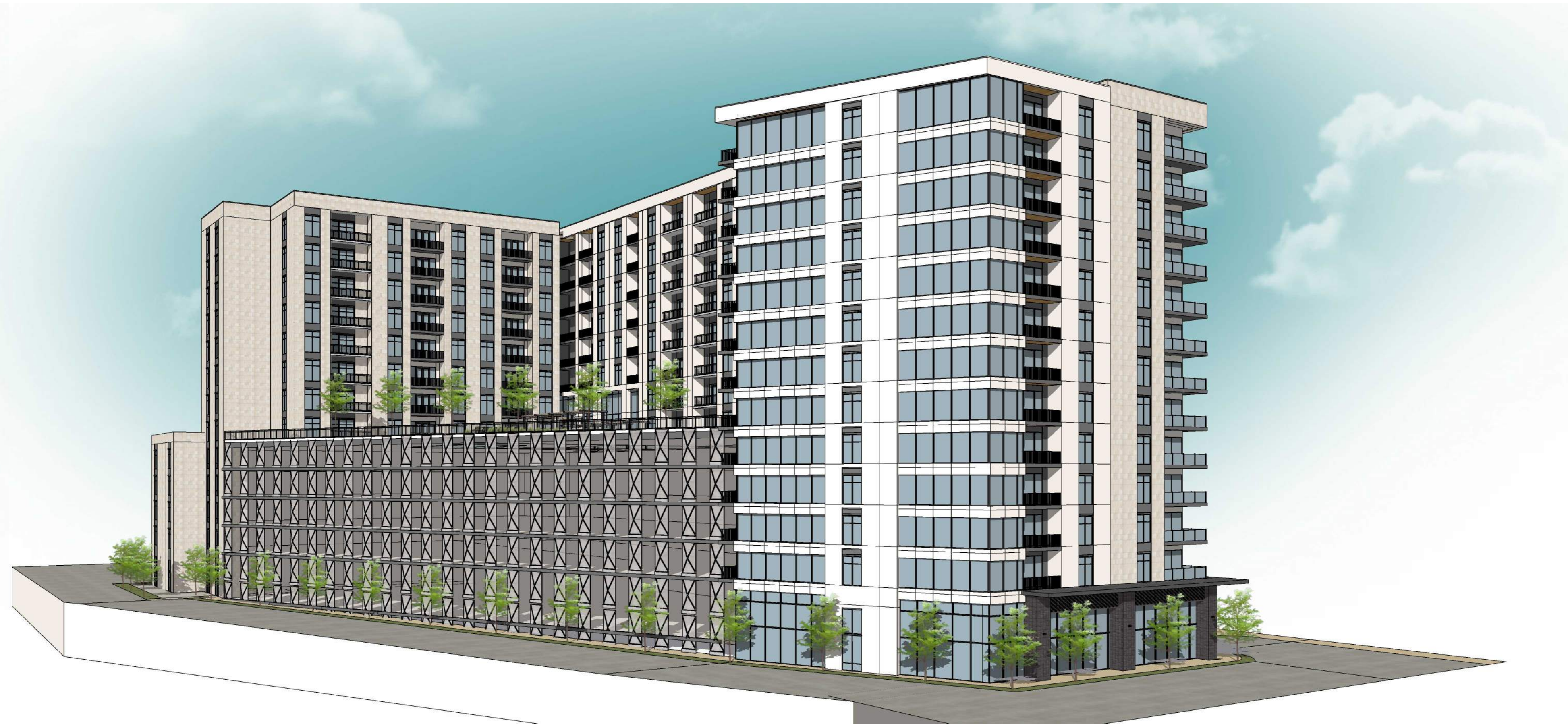
02 MULTIFAMILY HR OPT 1 - PERSPECTIVE