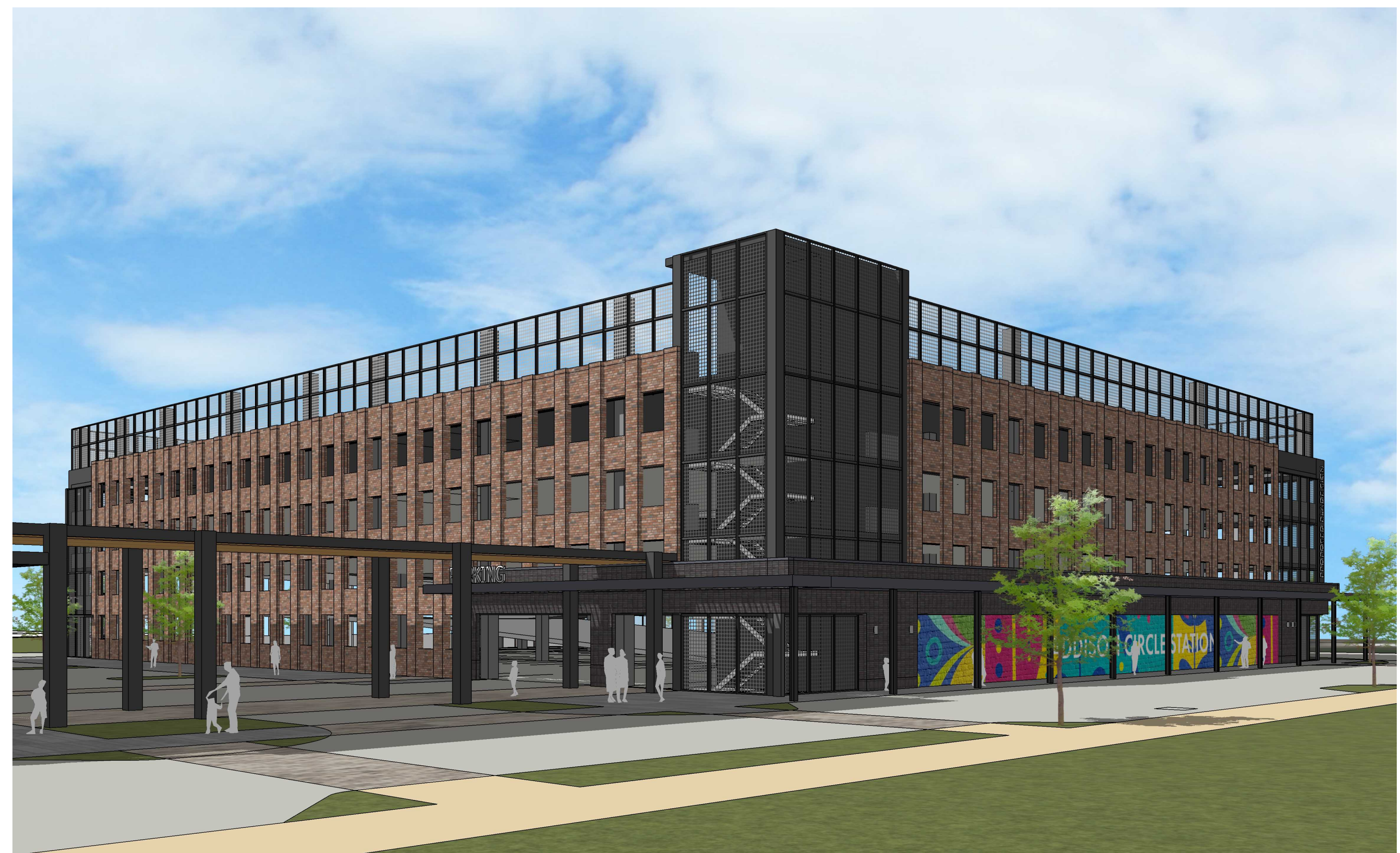
1 OFFICE GARAGE - PERSPECTIVE