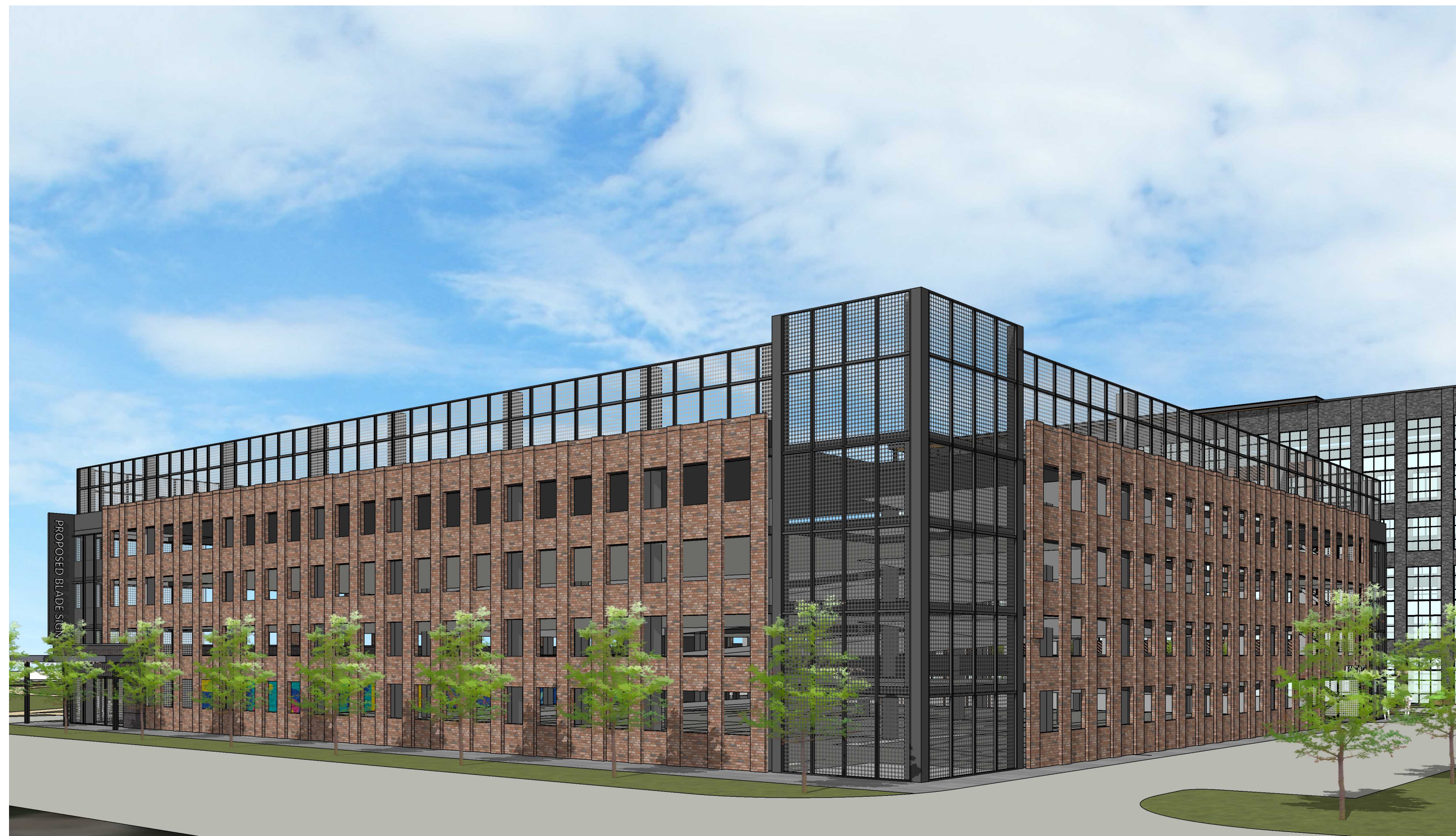
3 OFFICE GARAGE - PERSPECTIVE