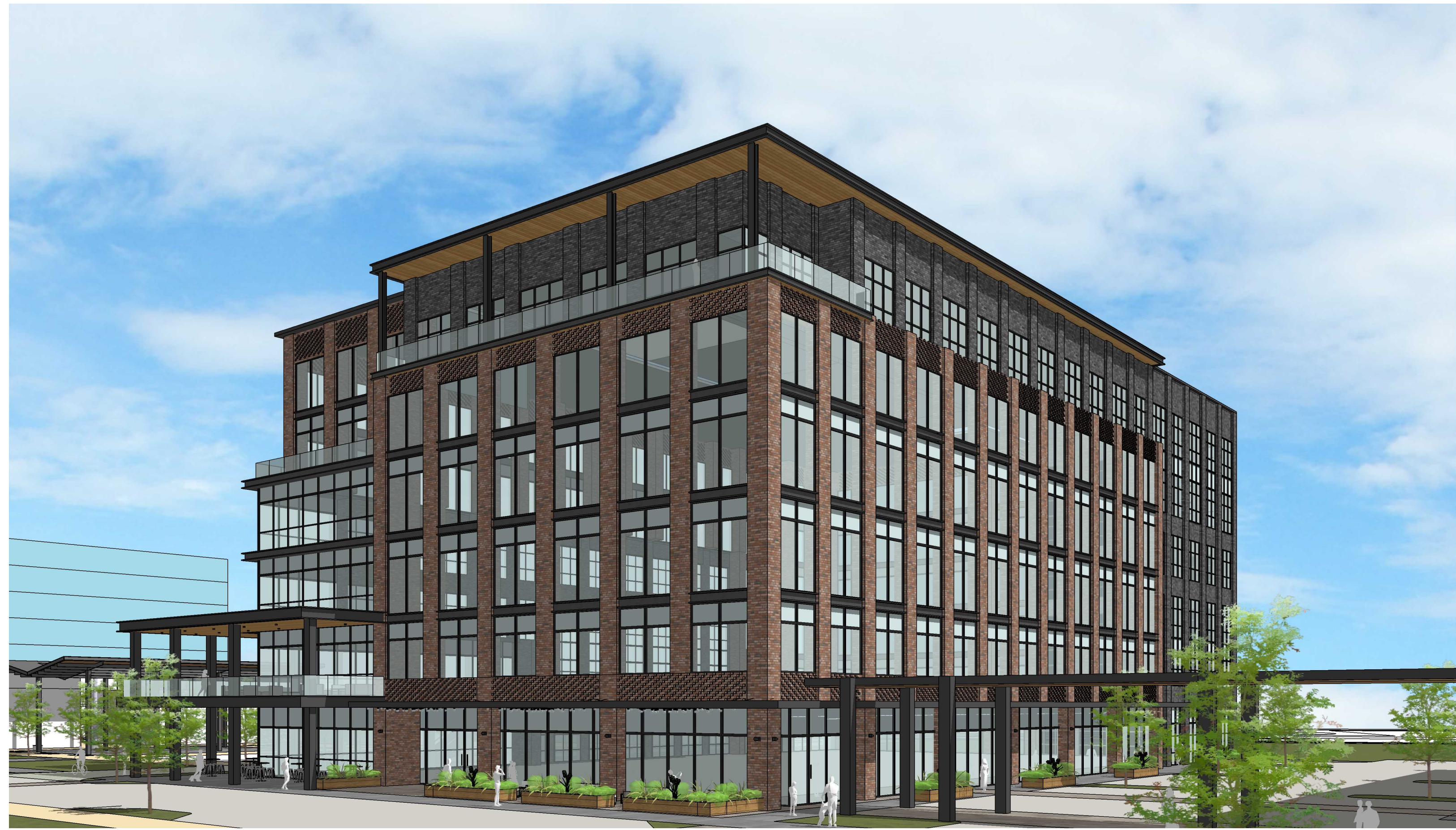
2 OFFICE - PERSPECTIVE