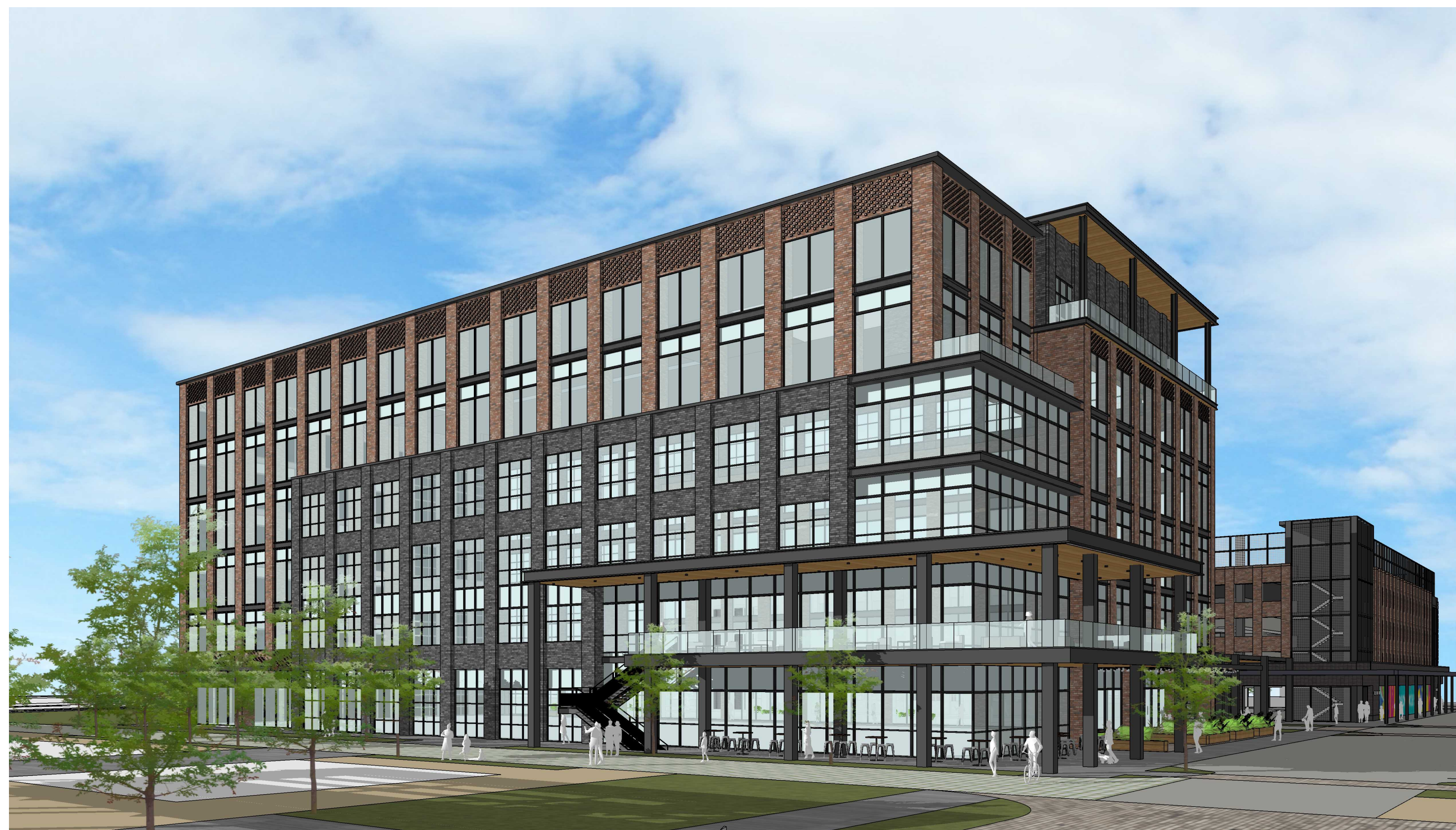
1 OFFICE - PERSPECTIVE