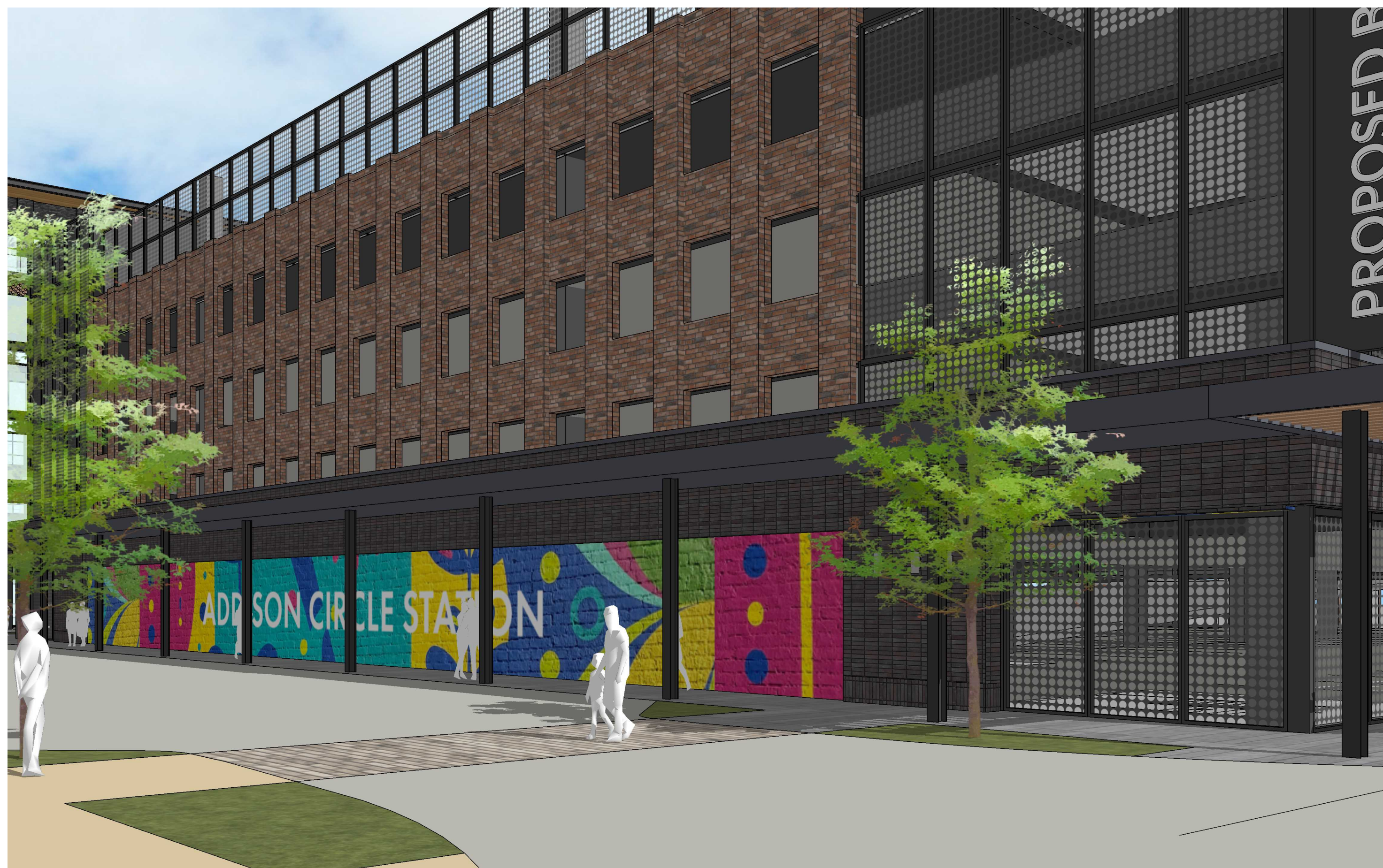
2 OFFICE GARAGE - PERSPECTIVE