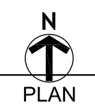
01 SITE PLAN NST