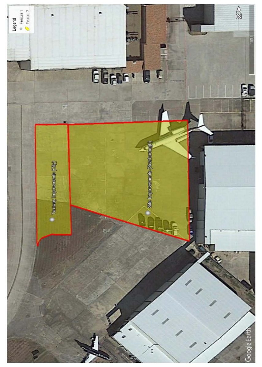
Exhibit 1: Project Site Description Chapter 212 Developer Participation Agreement (Scarborough Airport I, LP)

DEPCTION OF SCARBOROUGH SITE IMPROVEMENTS AND CITY TAXIWAY CITY IMPROVEMENTS