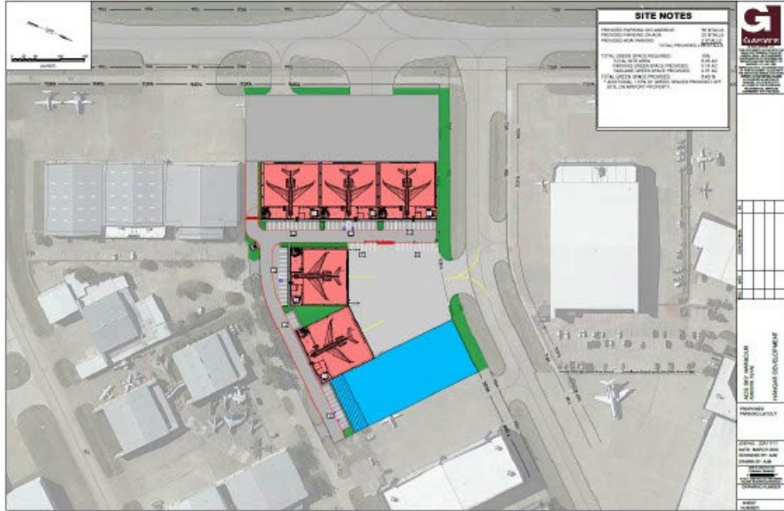
Note: Artist's rendering of proposed improvements, subject to permitting and approvals

This Exhibit 4 hereby includes by reference the complete set of Design Plans approved by the Town of Addison for the New Building Improvements including, but not limited to, all architectural, civil, mechanical, and electrical and landscape drawings and specifications, together with all change orders and as-built modifications, warranties and guaranties procured by Tenant.