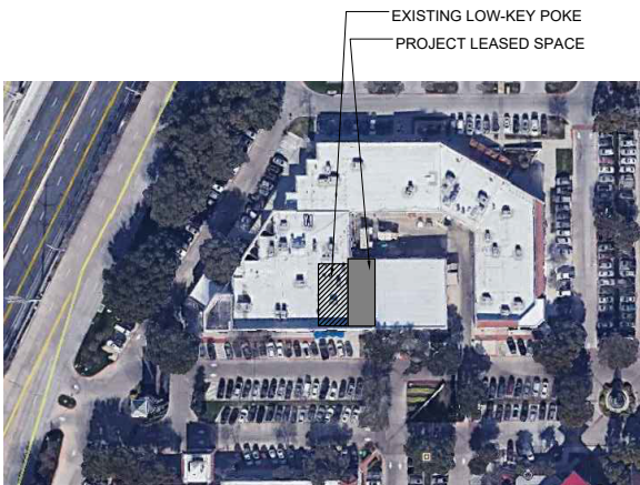
2 PROJECT SPACE NONE

Interior Area: 3,780 sqft. Patio Area: 200 sqft. Total Seating: 135