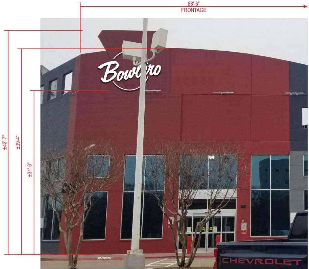
PROPOSED SIGN SOUTHEAST ELEVATION SCALE: 1/8"=1'-0"

3,481 SQ. FT. WALL SURFACE (39'-4" x 88'-6")