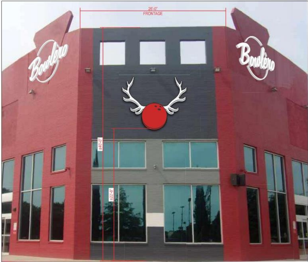
CURRENT SIGN SOUTH ELEVATION