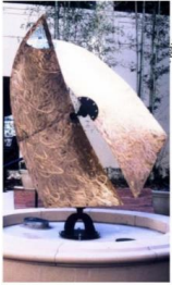
"AIKOO" BY DAVID B. HICKMAN 12'x12'x12', FABRICATED BRONZE, GLASS, STEEL WITH TWO WIND-ACTIVATED FORMS.