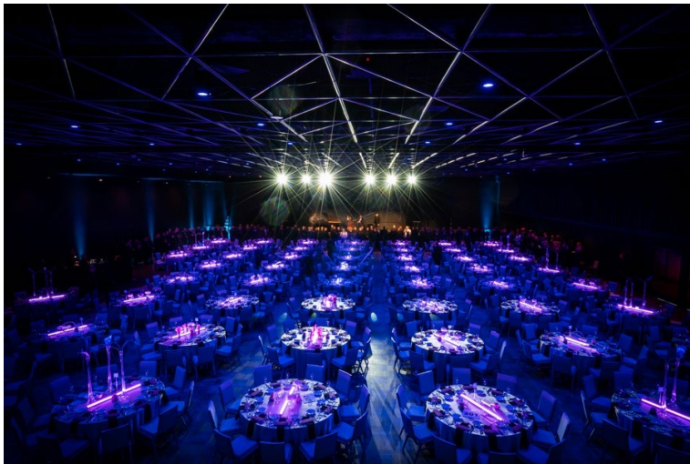
Turtle Creek Chorale Rhapsody (Idina Menzel)