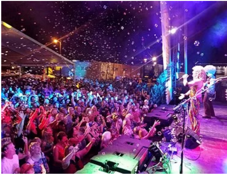
Grapevine Grapefest (Little River Band, ABC)