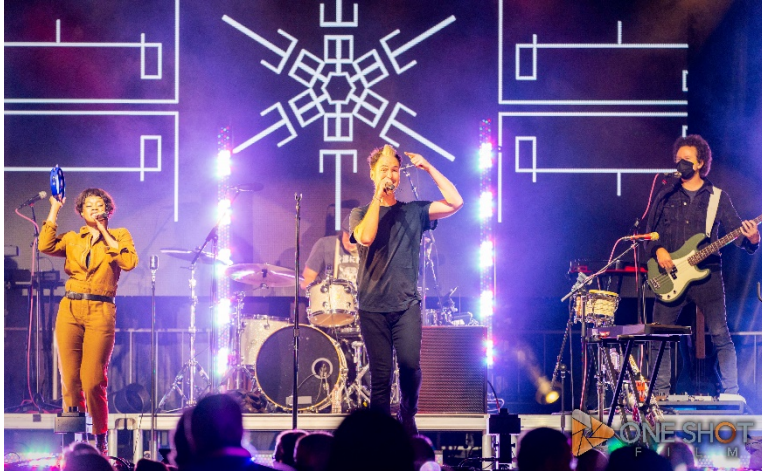
MPI WEC Opening Night (Fitz & The Tantrums)