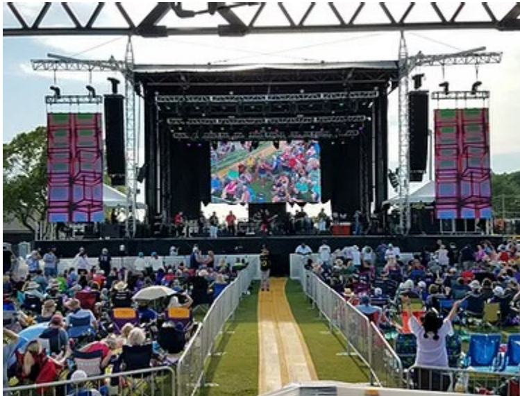
Lewisville 50 th Pop Anniversary (ZZ Top, Chicago)