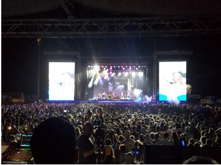
Univision (J. Balvin)