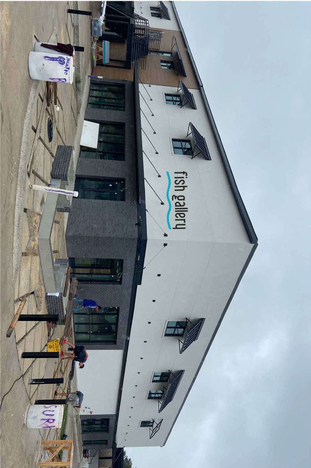
The sign is located 18 feet from grade.