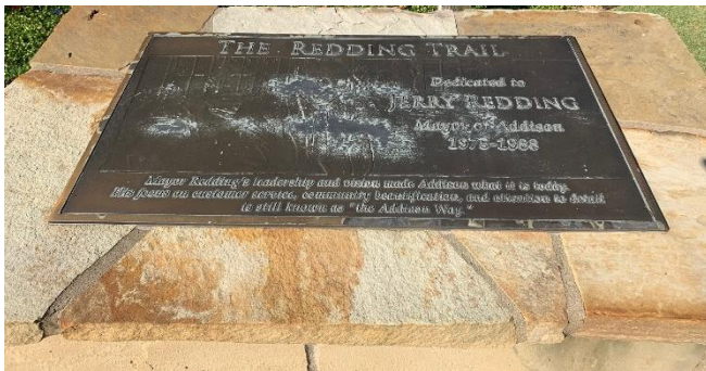
Example of a Facility Naming Plaque Plaque is approximately 32” x 20”.

Would Council prefer to leave the dimensions as stated above or change all dimensions to 24” x 36” ?