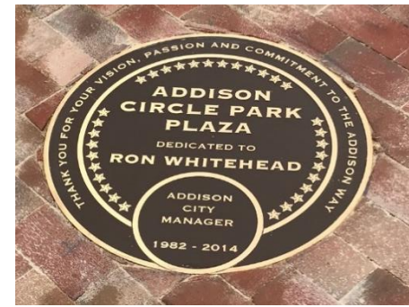
Example of Area Dedication Plaque Plaque is approximately 24”

Section II. Item C, was modified in the proposed policy was modified to include the word dedication to align with terminology that is being used on the plaques.