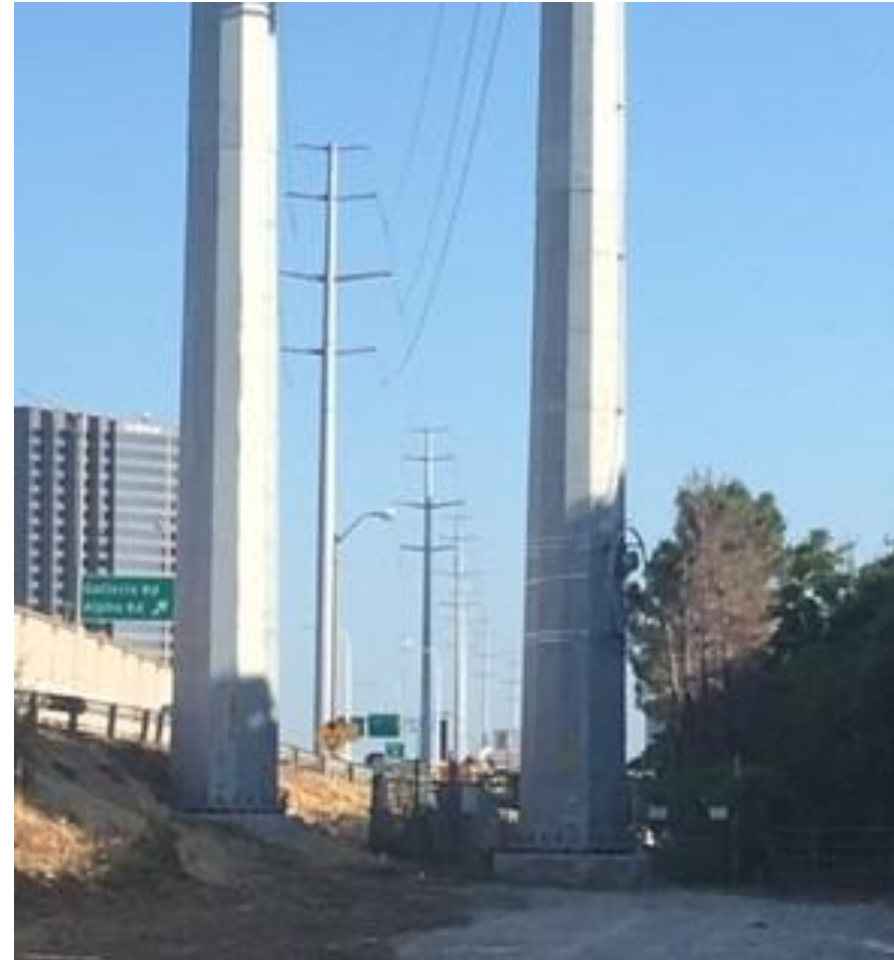
Example of Future Towers