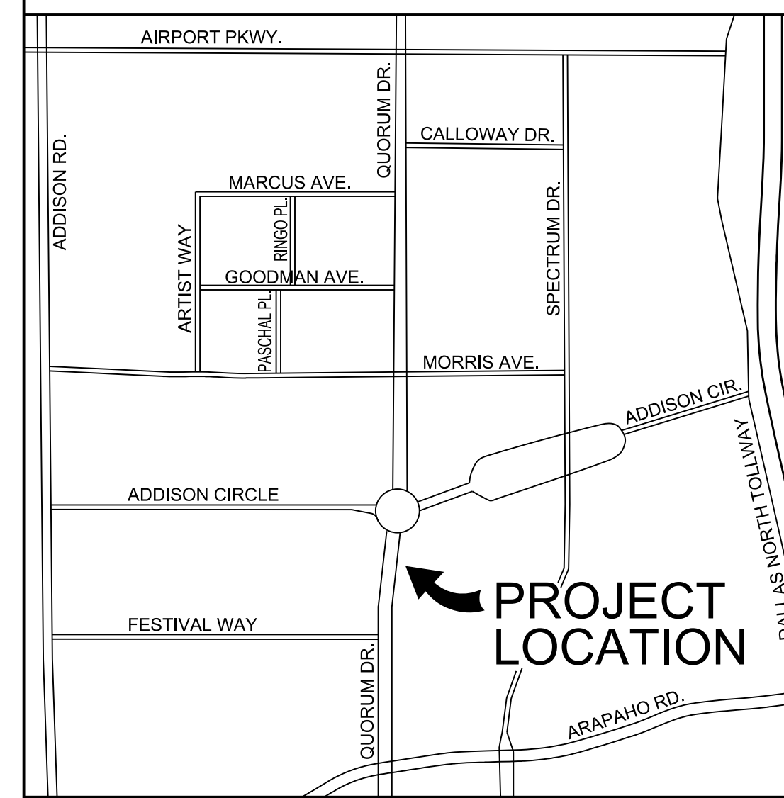
Addison, Texas Not To Scale