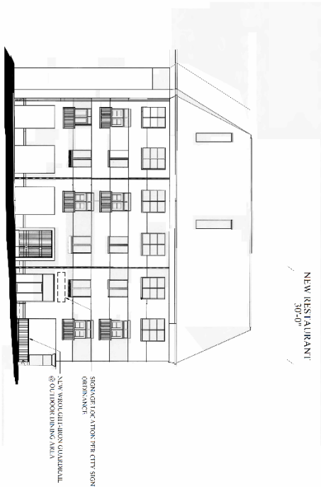
2 EXISTING NORTHEAST ELEVATION