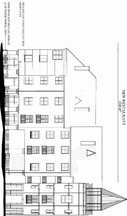
1 EXISTING NORTH ELEVATION