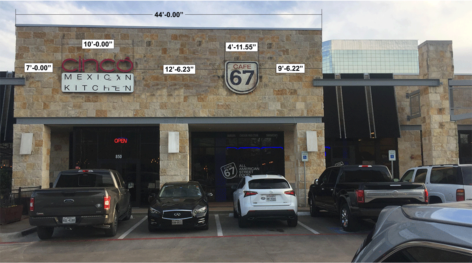
MOVE SIGNS TO THIS CONFIGURATION