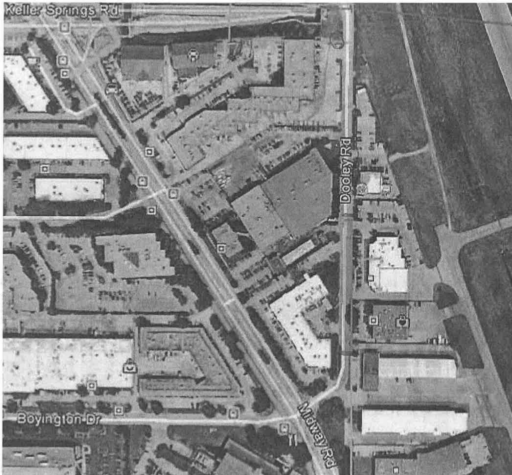
EXHIBIT A: DOOLEY ROAD - ASBESTOS CONCRETE WATER LINE REPLACEMENT