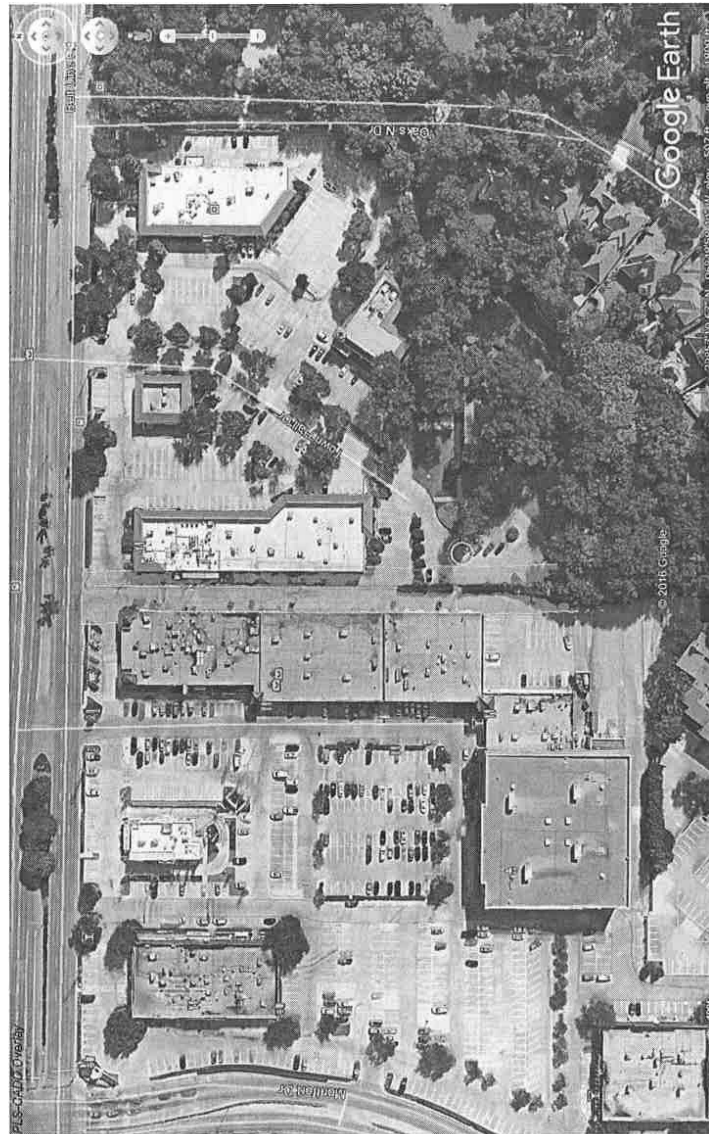
EXHIBIT B: PRESTONWOOD - DUCTILE IRON WATER LINE REPLACEMENT