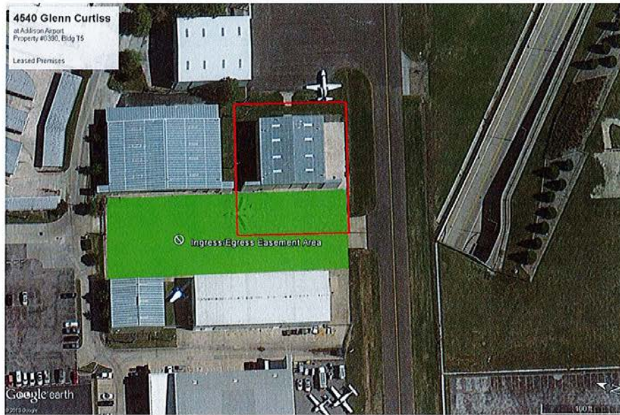
Figure 1: Red line shows approximate lease boundary. Green shaded depicts access easement area

Below is a depiction of the proximity of the Premises for informational purposes only and is not to be construed as accurate in area or dimension.