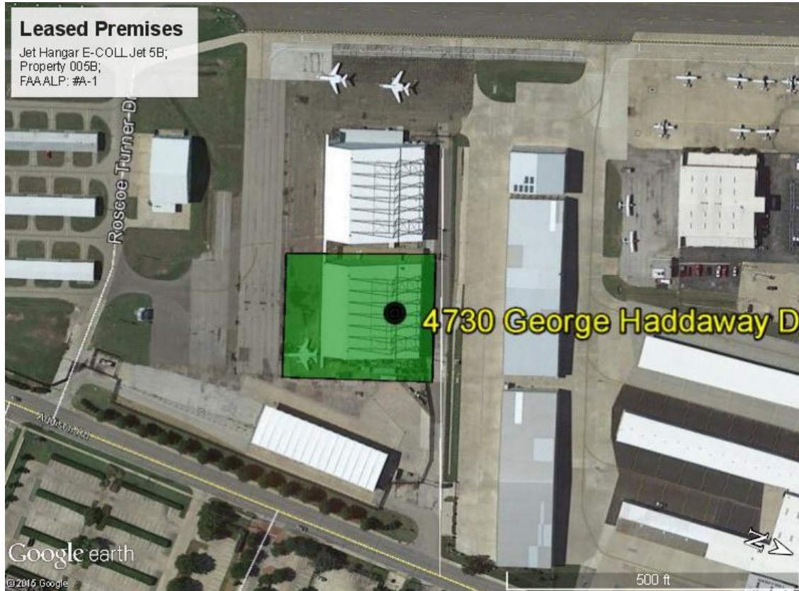
Figure 1: Shaded area depicts approximate lease boundary.

Below is a depiction of the proximity of the Premises for informational purposes only and is not to be construed as accurate in area or dimension.