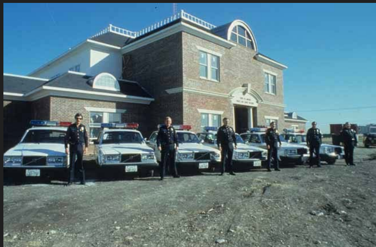
1983 – Officers in front of the newly constructed Police and Courts building along side their Volvo patrol cars.